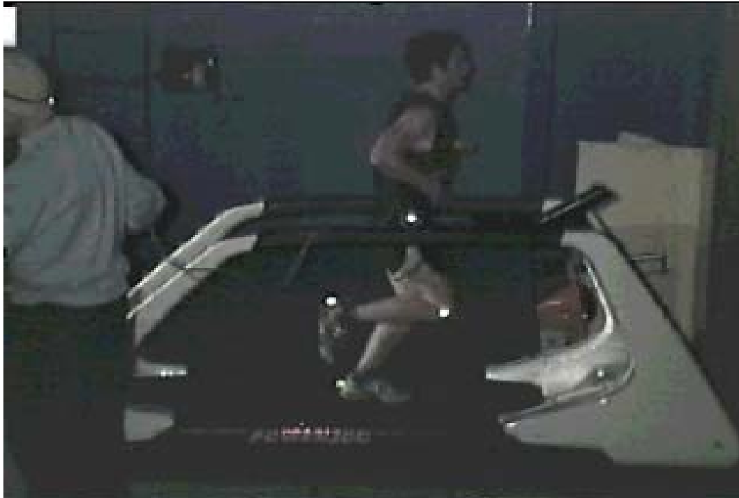
Figure 1. Subject with reflective markers performing the running portion of the triathlon transition.